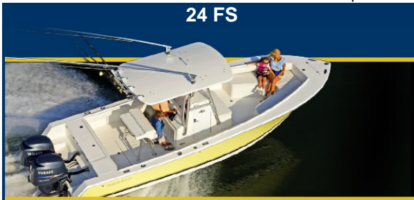
Hull: Aqua Mist

Dual Fuel Fills Lenco 12X16 Stainless Steel Trim Tabs Cockpit Lighting Bilge Pump w/ Automatic Float Switch Springline and Cockpit Cleats w/ Hawse Pipes Stainless Steel Hardware Thru Bolted w/ Elastic Stop Nuts