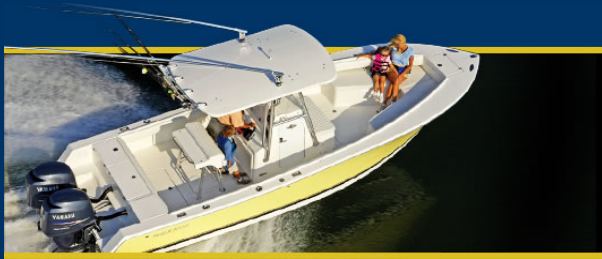
Hull: Aqua Mist

Anna Maria, FL 941-778-0755 Naples, FL 239-430-2833 Destin, FL 850-654-1575 St. Petersburg, FL 727-576-8336 Panama City, FL 850-230-4151 Riviera Dunes, FL 941-845-8965 Seabrook, TX 281-474-1470