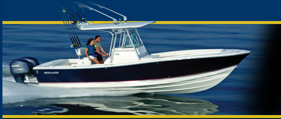
Hull: Blue Tone White